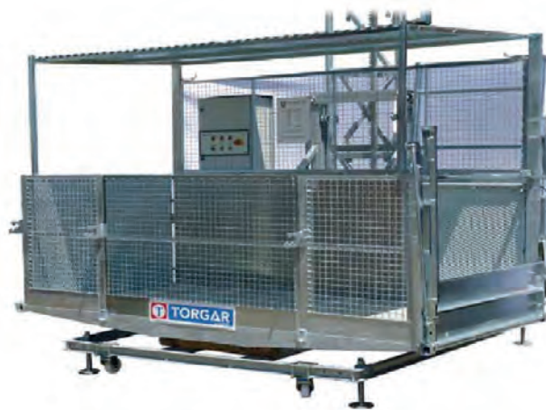
Model shown: PL-15